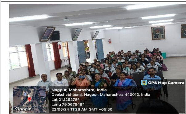
Audience attending the programme