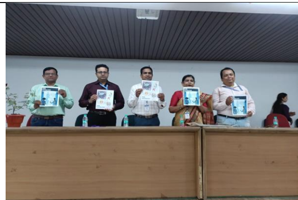
Magazine fourth edition release by Faculty members