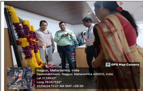
Garlanding the portraits by faculty members